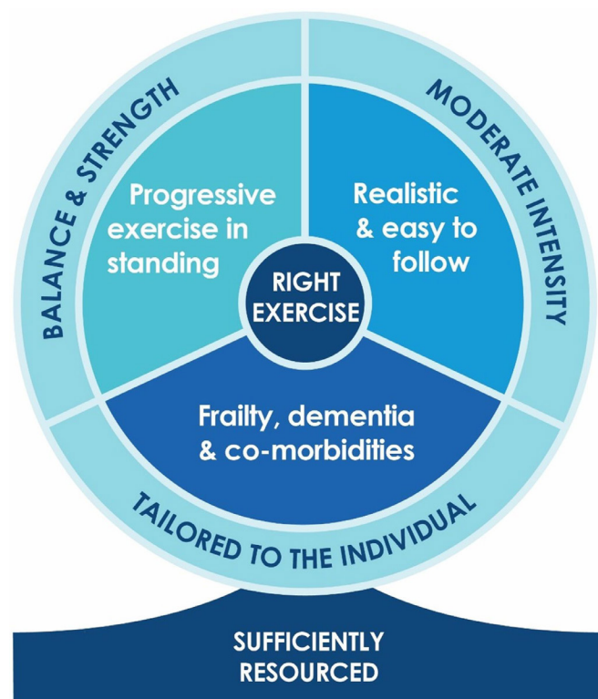
Figure 2 ICA theory of effective fall prevention exercise in residential aged care. ICA, intervention component analysis.

fallers and in other settings to enhance the generalisability of our ICA and bolster the quality of evidence.