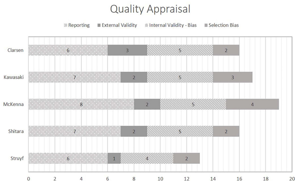
Figure 3 Stacked bar chart of study quality according to the modified Downs and Black checklist.

Measurement of scapular dyskinesis varied, as one included study 35 reported scapular dyskinesis using continuous data,